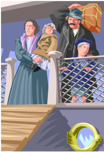
Immigration unit starts in December

November has certainly been a busy month. Our culmination of our Hooray for the USA unit took place on the day before Veteran's Day with our presentation of the assembly. We honored our veterans with songs, recitations, and displays.