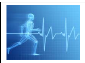
The Fit Kids Program runs for 7 weeks.

learned about our lungs and heart, the dangers of smoking, and how to make fitness a part of our everyday lives. Parent conferences will be taking place on November 17 th and November 19 th . Be sure to stop in and visit the book fair during conferences. We are getting geared up for a fun-filled second quarter! Be sure to check the "teacher Moodle sites" to find out what is going on in your child's classroom!