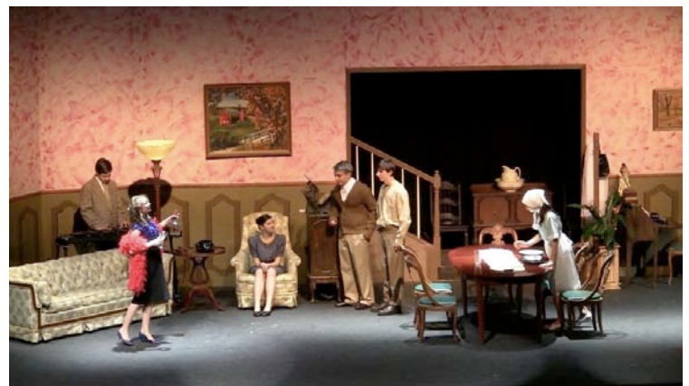
Scenes from "You Can't Take It With You"