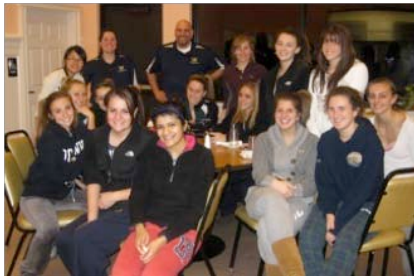
The S.M.I.L.E.S. Group traveled to Cor Unum, a meal distribution center in Lawrence, MA on December 30th to help out during the Holiday Season.